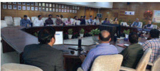
White Paper on “Drone Applications for Power Sector” released in World Utility Summit 2023