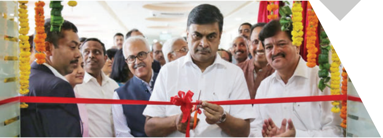
Launch of Virtual SGKC by Hon'ble Cabinet Minister, R.K. Singh, Ministry of Power and Ministry of New and Renewable Energy

In South Asia, the United States Agency for International Development (USAID) program, the South Asia Regional Energy Partnership (SAREP) is supporting Distribution Utilities for providing quality, reliable, efficient, cleaner 24x7 power supply to all citizens. Ministry of Power (MoP), Government of India (GoI) is implementing distribution reforms through its flagship Revamped Distribution Sector Scheme (RDSS) with the goal of minimizing Aggregate Technical and Commercial (AT&C) losses and enhancing the distribution infrastructure. SAREP is supporting MoP, nodal agencies and state distribution utilities to implement smart distribution, innovative demonstration projects and build capacity of workforce.