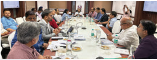
Three pilots launched to demonstrate the deployment of advanced technologies for the distribution utilities of Madhya Pradesh