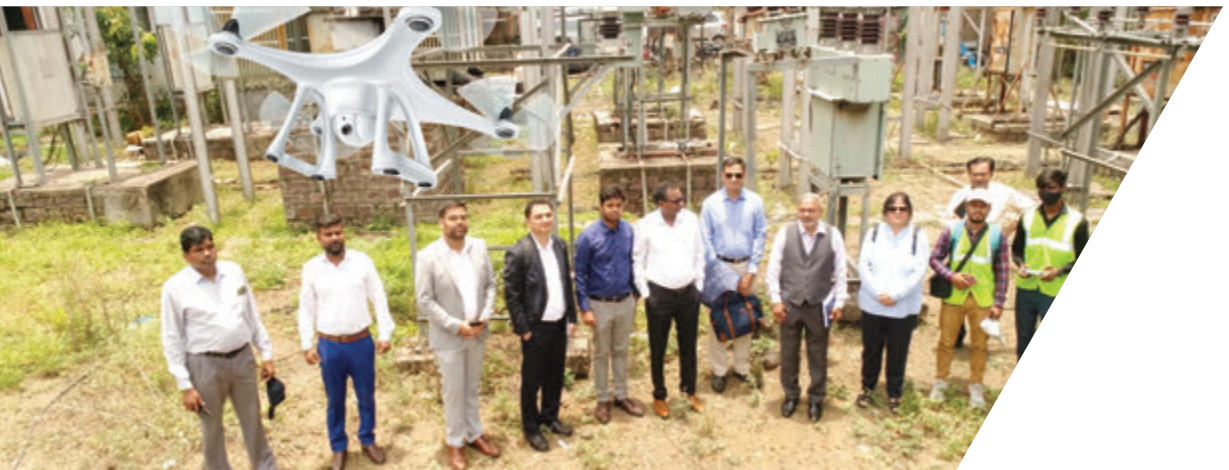
Advanced Technology Deployed using Artificial Intelligence based Drones in Bhopal, Madhya Pradesh

In South Asia, the United States Agency for International Development (USAID) program, the South Asia Regional Energy Partnership (SAREP) is supporting Distribution Utilities for providing quality, reliable, efficient, cleaner 24x7 power supply to all citizens. Ministry of Power (MoP), Government of India (GoI) is implementing distribution reforms through its flagship Revamped Distribution Sector Scheme (RDSS) with the goal of minimizing Aggregate Technical and Commercial (AT&C) losses and enhancing the distribution infrastructure. SAREP is supporting MoP, nodal agencies and state distribution utilities to implement smart distribution, innovative demonstration projects and build capacity of workforce.