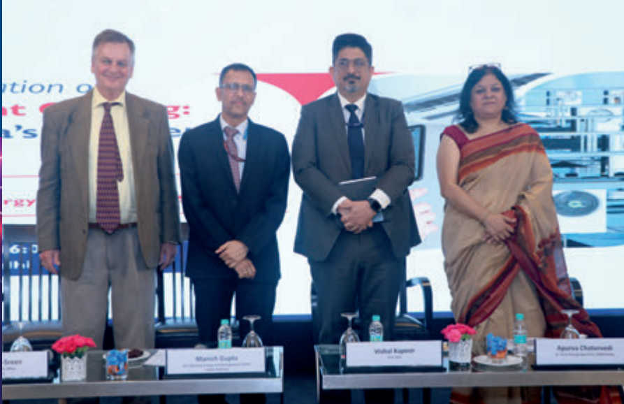
MoU between USAID and EESL signed at the Industry Consultation on “Super-Efficient Cooling: Enabling India’s Net Zero Transition”

” Energy Efficiency Services Limited (EESL) is at the forefront of energy efficiency interventions in India. I am delighted to announce that the new strategy of EESL is completely aligned with the visionary goal of the Government of India—to transform India into a net-zero country by 2070.