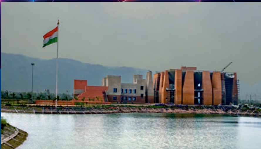
Nalanda University Net Zero Energy Campus