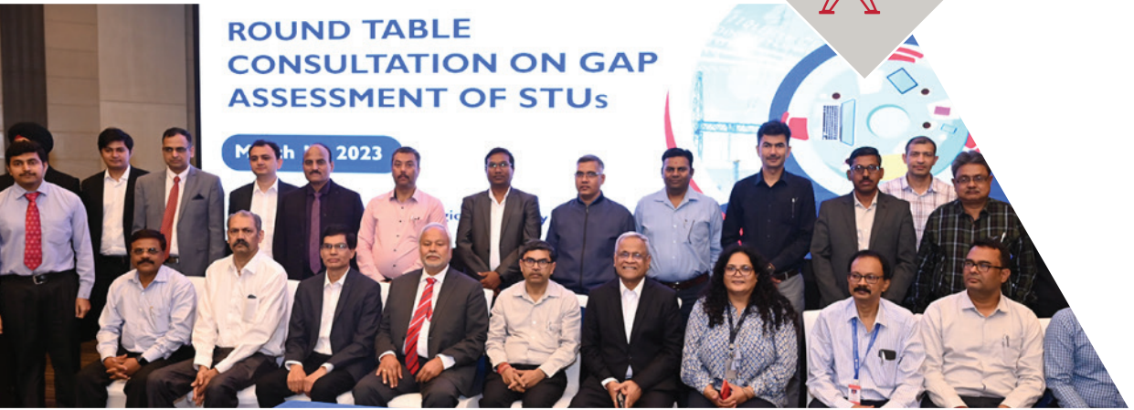
Delegates at Round Table Consultation on Gap Assessment of State Transmission Utilities

As nations across South Asia strive to increase the Renewable Energy (RE) generation and reduce their carbon footprint, an efficient power network becomes crucial for facilitating the transition to sustainable energy and integrating renewable sources into the power grid. In addition, establishing a resilient and technologically advanced transmission network is crucial for withstanding cyberattacks and natural disasters. The United States Agency for International Development (USAID) through the South Asia Regional Energy Partnership (SAREP) program is actively supporting transmission utilities and system operators across various South Asian regions through modernization efforts. This includes gap assessments, roadmap development, evaluation of network strengthening requirements, and development of frameworks to reinforce system inertia. These initiatives aim to enhance grid reliability and facilitate seamless absorption of high levels of renewable energy, and contribute to the development of a forward-looking energy transmission infrastructure.