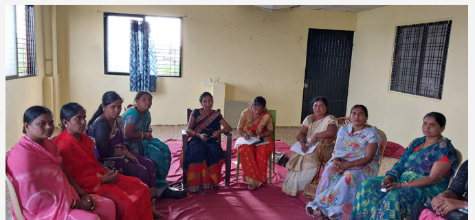
Swayam Sakhis undergoing a training program