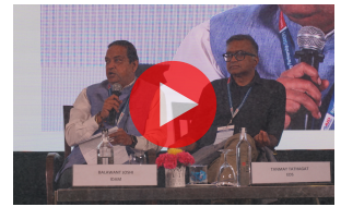
Session 1- Distributed Energy Resources for Demand Flexibility and Grid