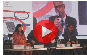
Session 2- Smart Metering and Data Analytics | Session 2 at SACEF 2023