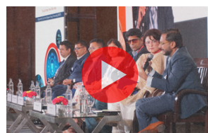
Session 7- What Works? Innovative Financing Strategies in South Asia