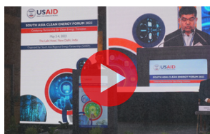
Closing Session- South Asia Clean Energy Forum (SACEF) 2023 Closing Session

Click thumbnail to watch the recordings of the sessions.