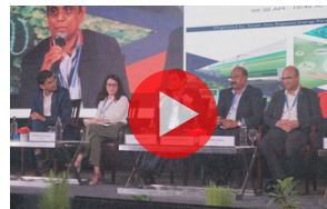
Session 5- Advancing Green Hydrogen through Collaborative Efforts in South Asia