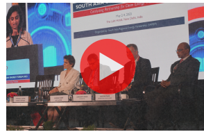
Opening session- South Asia Clean Energy Forum (SACEF) 2023 Opening Session