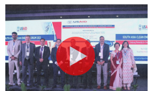
Session 8- Training and Skills Development for Clean Energy Work Force