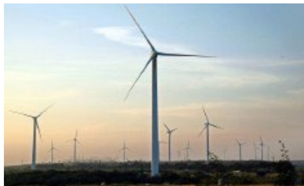
WIND FARM, MAHARASHTRA STATE

Through its $12 million Partnership Fund, SAREP will issue multiple grants to advance demonstration and scale-up of transformational and replicable business models, new technologies, innovative financing mechanisms, and other solutions. The Partnership Fund will maximize the impact of USAID resources, expand private sector engagement and partnerships, and facilitate opportunities for co-creation.