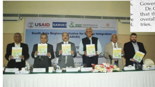
Prime Minister’s International Affairs Adviser Dr Gower Rizvi, alongside other guests, holds the report ‘Economic benefits from Bangladesh-India Electricity Trade’ for a photo shoot during the launching of the report at a hotel in the capital yesterday.

Rizvi praises Indian role in power sector Report on economic benefits of electricity trade between Bangladesh and India released